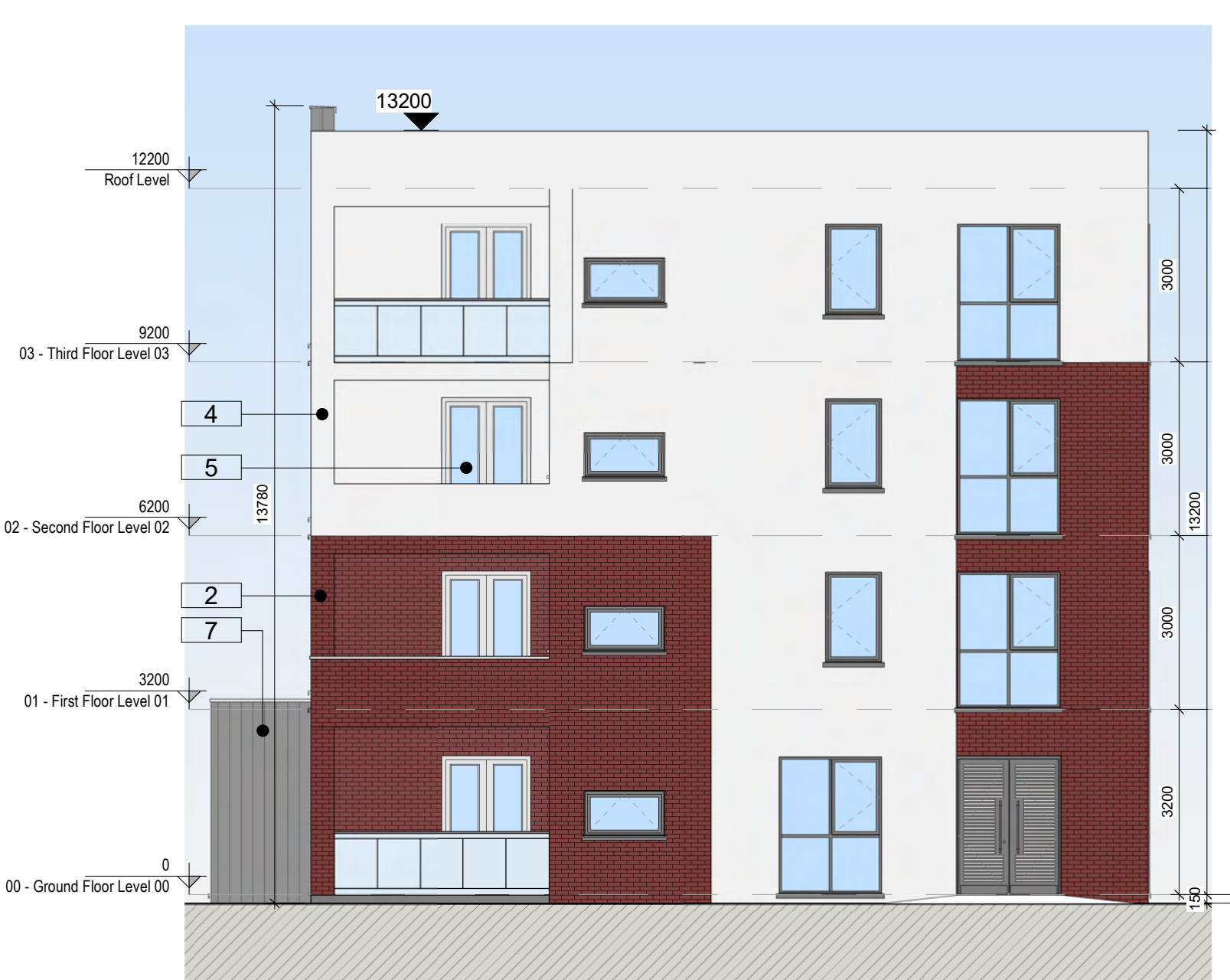
3 Right Elevation 1 : 100