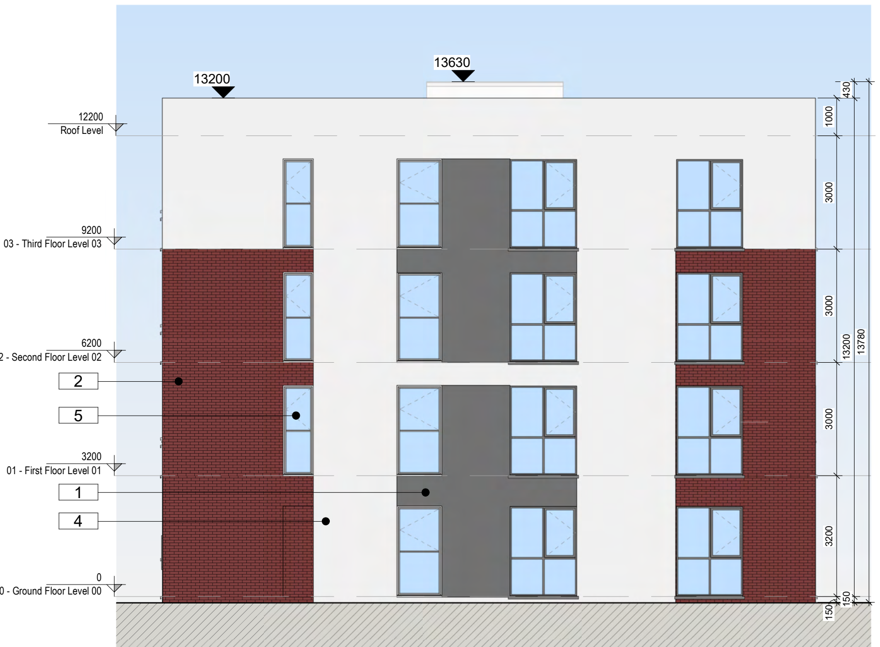
4 Back Elevation 1 : 100