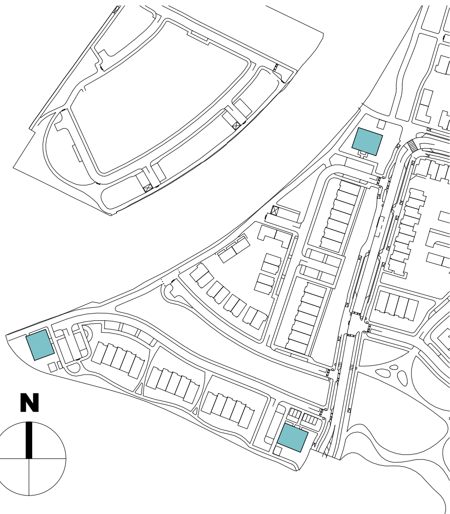
00 KEY PLAN (STREAM AREA-A) 1 : 2500

ALL C+W O'BRIEN LTD DRAWINGS TO BE READ IN CONJUNCTION WITH THE ARCHITECTURAL NATIONAL BUILDING SPECIFICATION (NBS) PROVIDED FOR THIS PROJECT