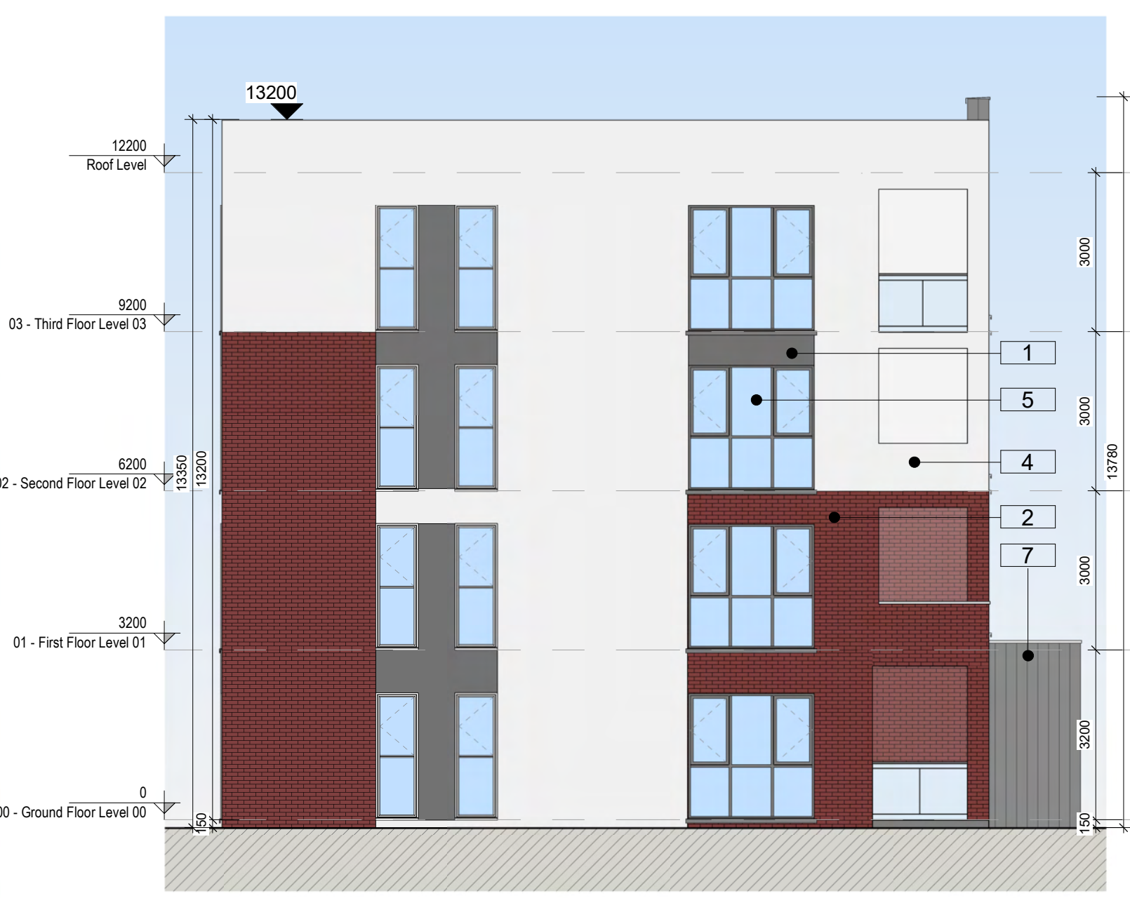
2 Left Elevation 1 : 100