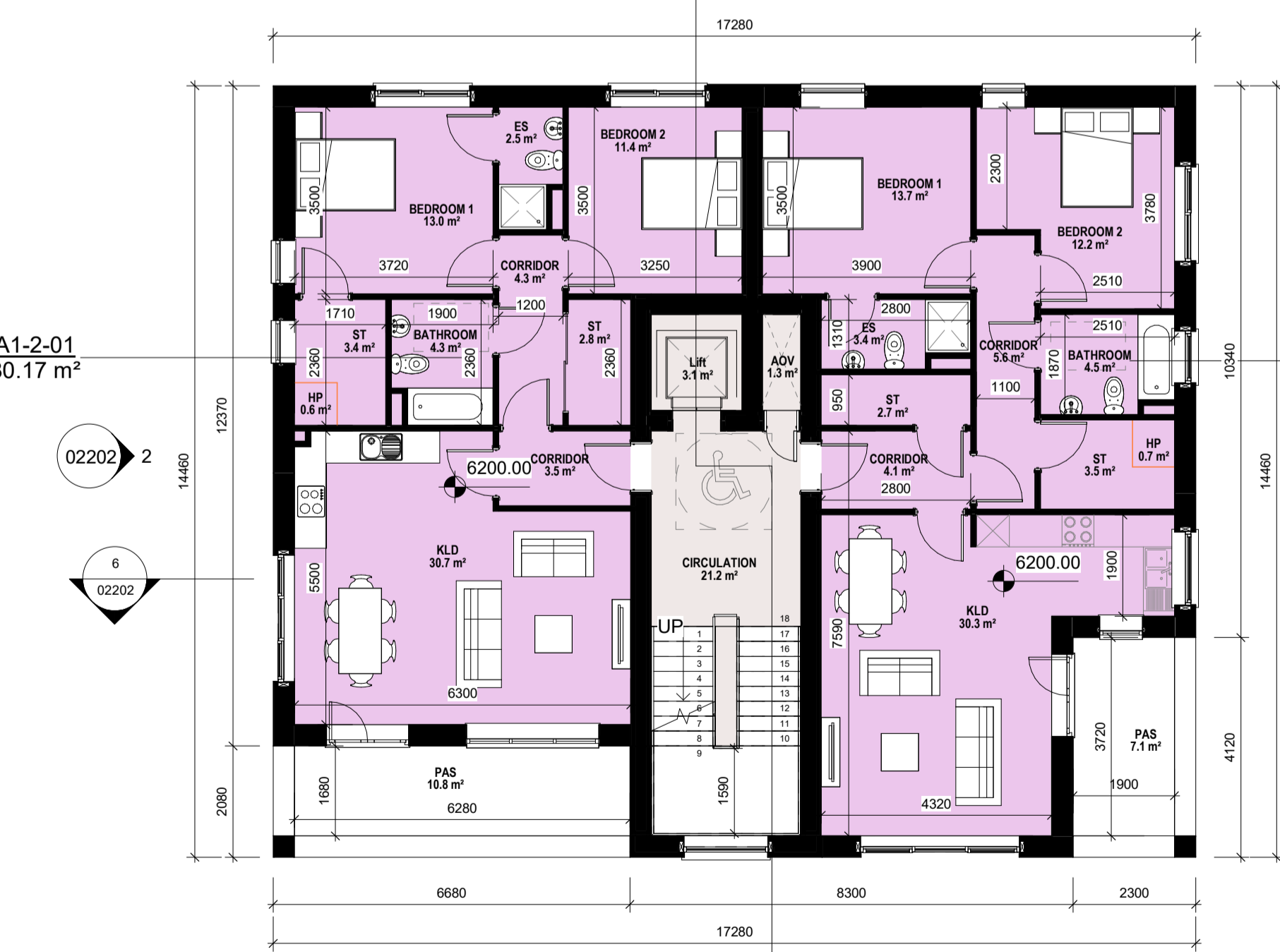
3 02 - Second Floor Plan 1: 100

GENERAL NOTES THIS DRAWING TO BE READ IN CONJUNCTION WITH ARCHITECTS' DRAWINGS, CONSULTANT ENGINEER'S DRAWINGS AND SPECIFICATIONS & LANDSCAPE ARCHITECTS' DRAWINGS ALL UNIT TYPE DRAWINGS - NORTH POINTS AND FLS VARY FOR EACH UNIT. PLEASE REFER TO THE SITE LAYOUT PLAN FOR ORIENTATION AND LOCATION. LEVELS GIVEN ON UNIT TYPE DRAWINGS ARE GIVEN TO A LOCAL ABSOLUTE ZERO LEVEL. FOR SPECIFIC LEVELS DEPENDING ON INDIVIDUAL UNIT LOCATION, REFER TO ARCHITECT'S CONTEXT SECTIONS AND ENGINEER'S DRAWINGS WHERE LEVELS ARE ALL GIVEN. FINAL SOLAR PANEL POSITION DEPENDS ON HOUSE ORIENTATION THE EXACT LOCATION & ORIENTATION WILL BE DEPENDENT ON FINAL BER RATING. SOLAR PANELS MAY BE OMITTED IN FAVOUR OF ALTERNATIVE RENEWABLE ENERGY SOURCE. REFER TO DRAWING NO. 02201 & 02202 FOR DETAILS REGARDING DIMENSIONS, AREAS & GENERAL NOTES. CHARACTER AREAS: A- BARNHILL STREAM B- BARNHILL CROSS C- BARNHILL CRESCENT D- STATION Q SOUTH