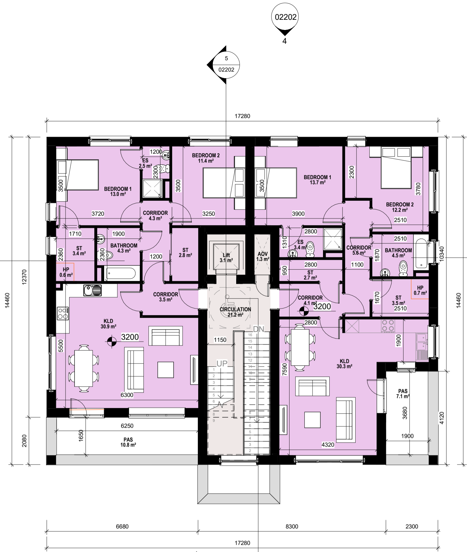
2 01 - First Floor Plan 1: 100