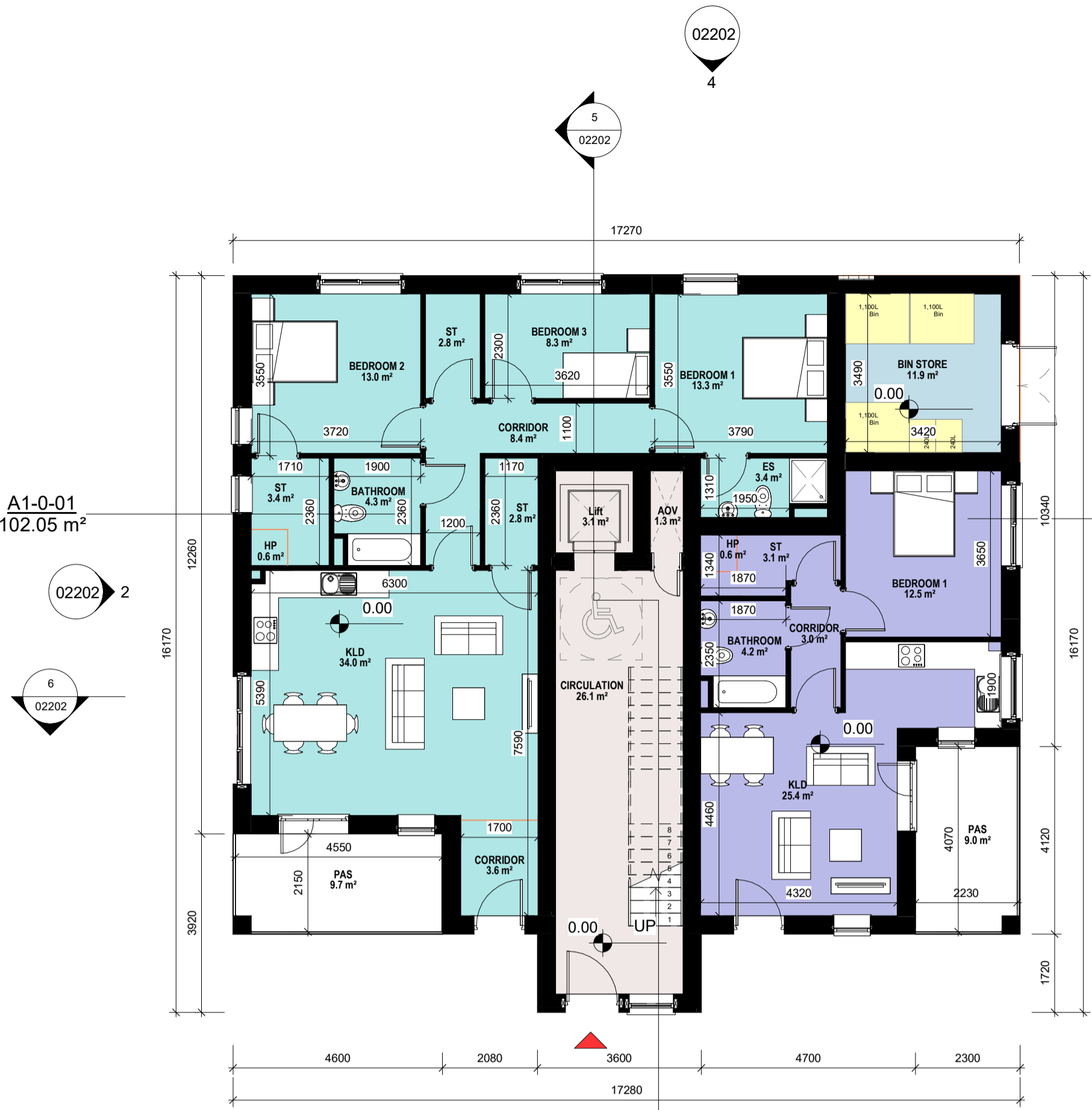
1 00 - Ground Floor Plan 1: 100

THE COPYRIGHT OF THIS DRAWING IS VESTED WITH C+W O'BRIEN LTD AND MUST NOT BE COPIED OR REPRODUCED WITHOUT THE CONSENT OF THE COMPANY. FIGURED DIMENSIONS ONLY TO BE TAKEN FROM THIS DRAWING. DO NOT SCALE. ALL CONTRACTORS MUST VISIT THE SITE AND BE RESPONSIBLE FOR CHECKING ALL SETTING OUT DIMENSIONS AND NOTIFYING THE ARCHITECT OF ANY DISCREPANCIES PRIOR TO ANY MANUFACTURE OR CONSTRUCTION WORK. ALL C+W O'BRIEN LTD DRAWINGS TO BE READ IN CONJUNCTION WITH THE ARCHITECTURAL NATIONAL BUILDING SPECIFICATION (NBS) PROVIDED FOR THIS PROJECT