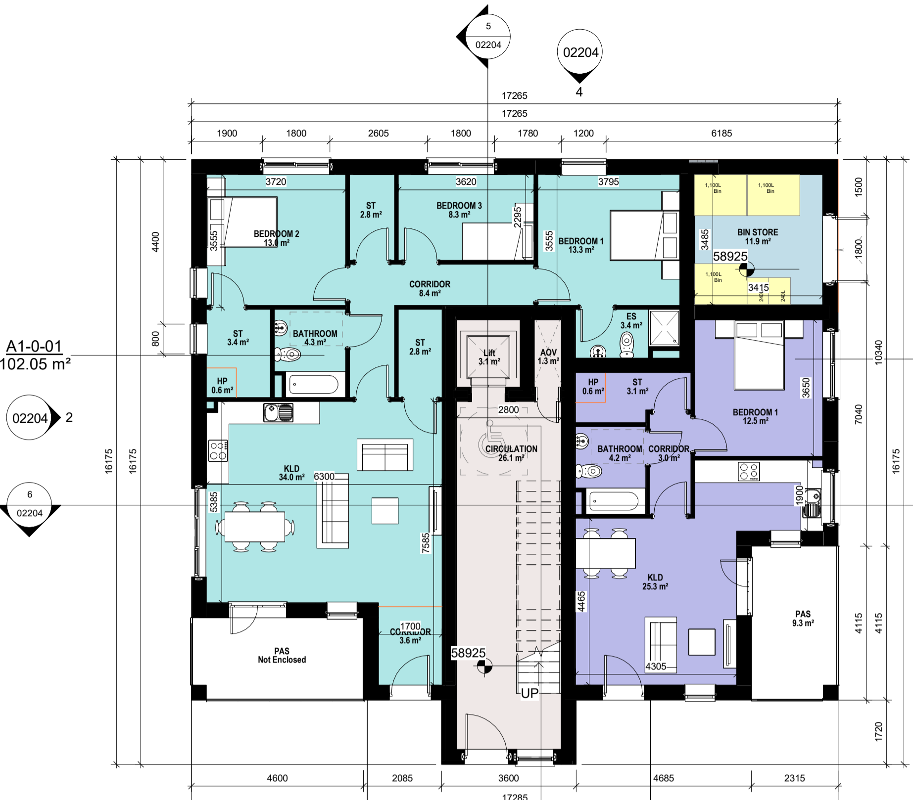
1 00 - Ground Floor Plan 1: 100