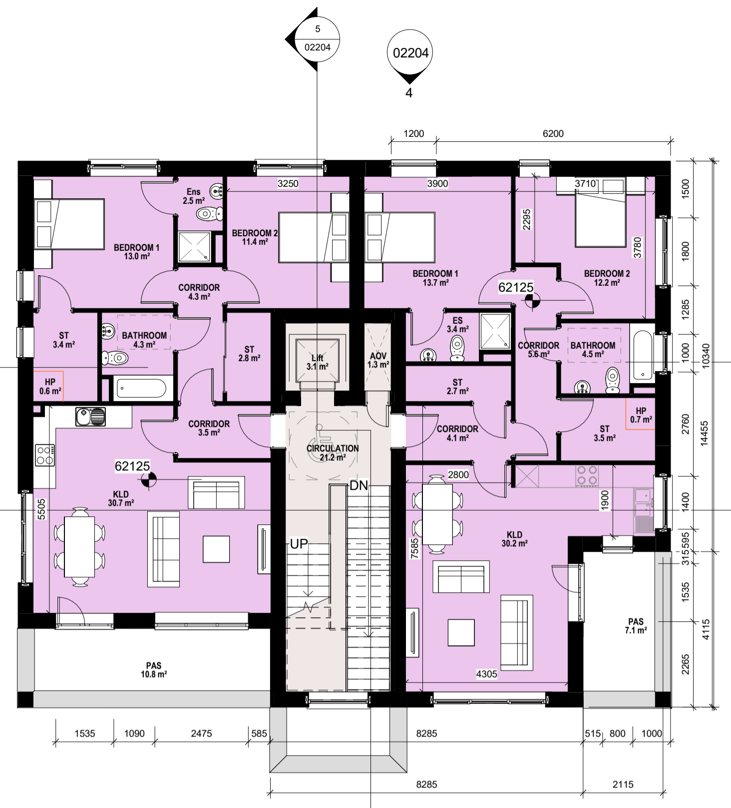
2 01 - First Floor Plan 1: 100