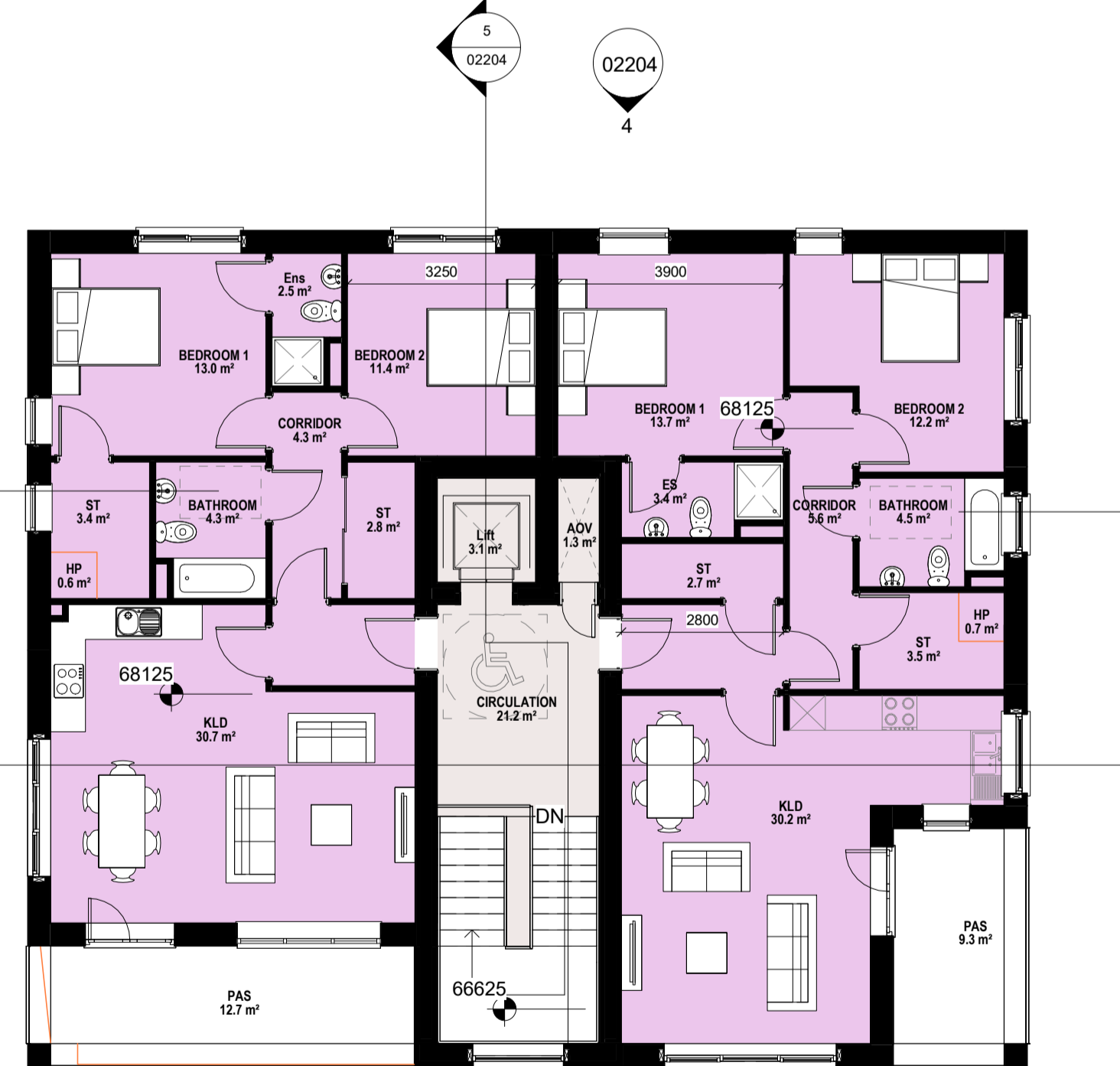
4 03 - Third Floor Plan 1: 100