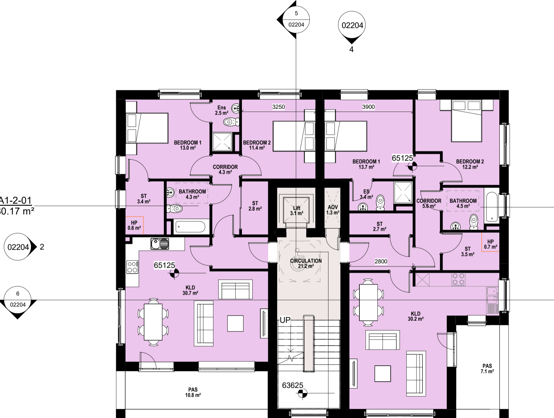
3 02 - Second Floor Plan 1: 100