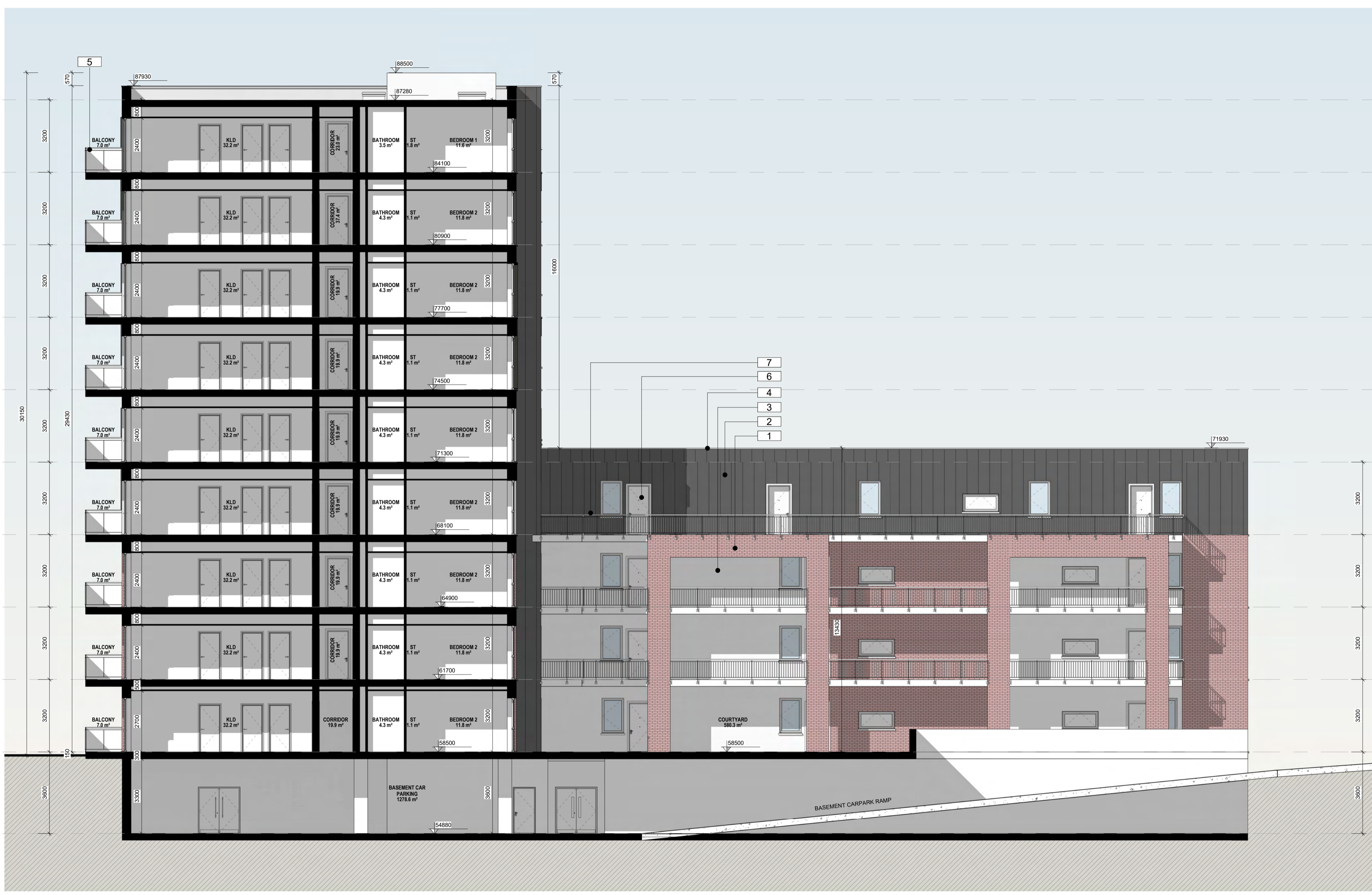
1 Courtyard North Elevation 1 : 100

Please consider the environment before printing this sheet