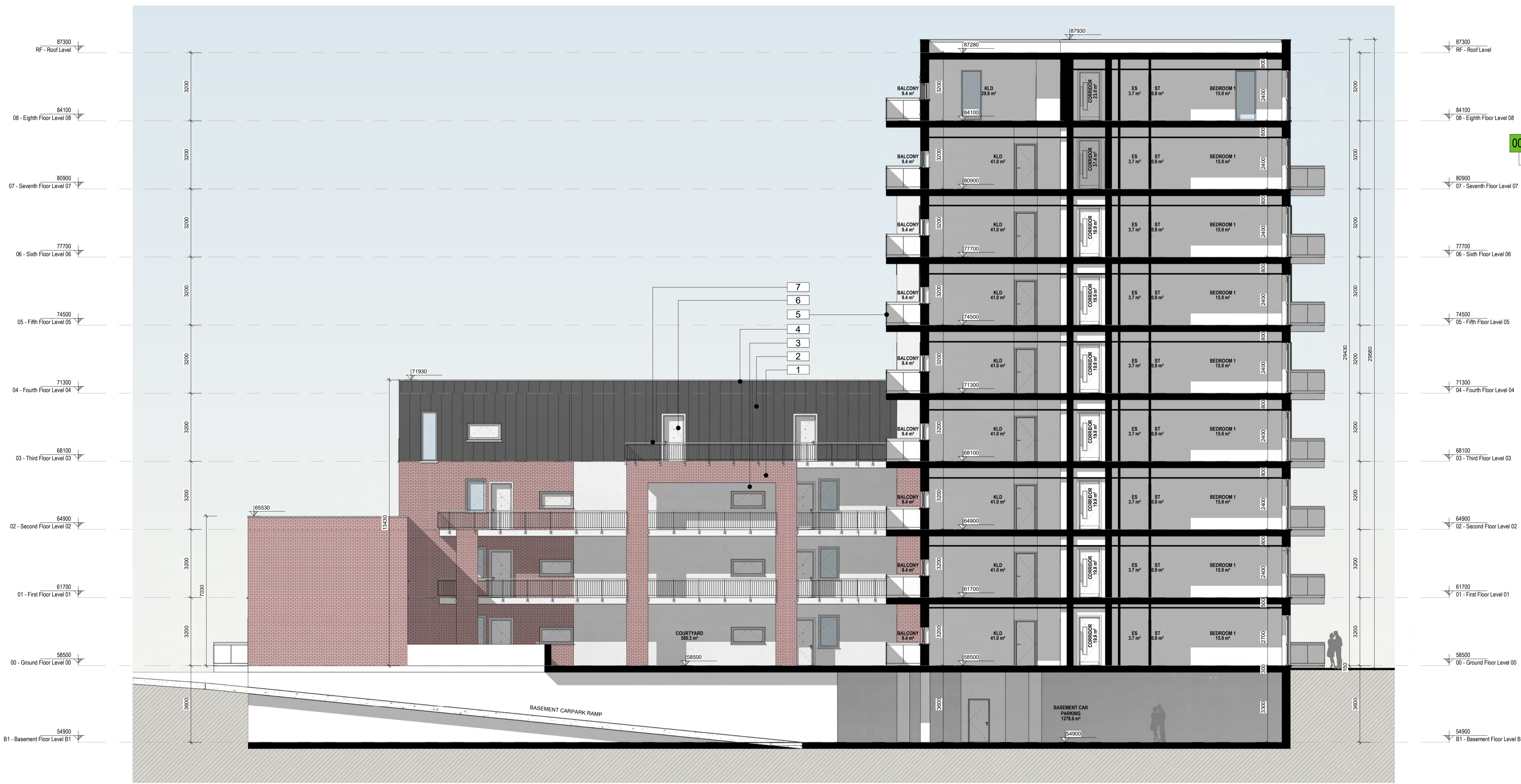
1 Courtyard South Elevation 1 : 100

Please consider the environment before printing this sheet