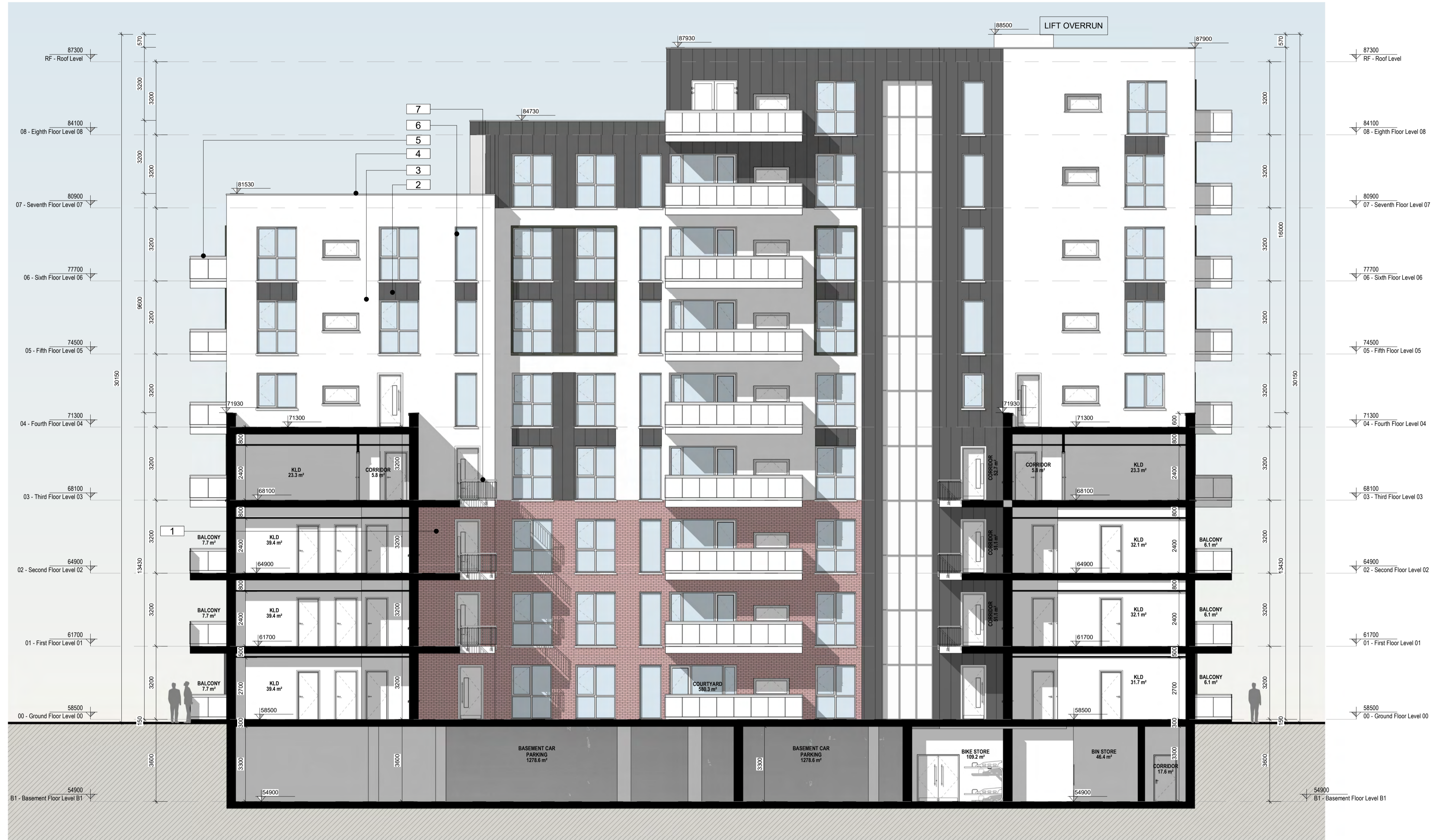
1 Courtyard West Elevation 1 : 100