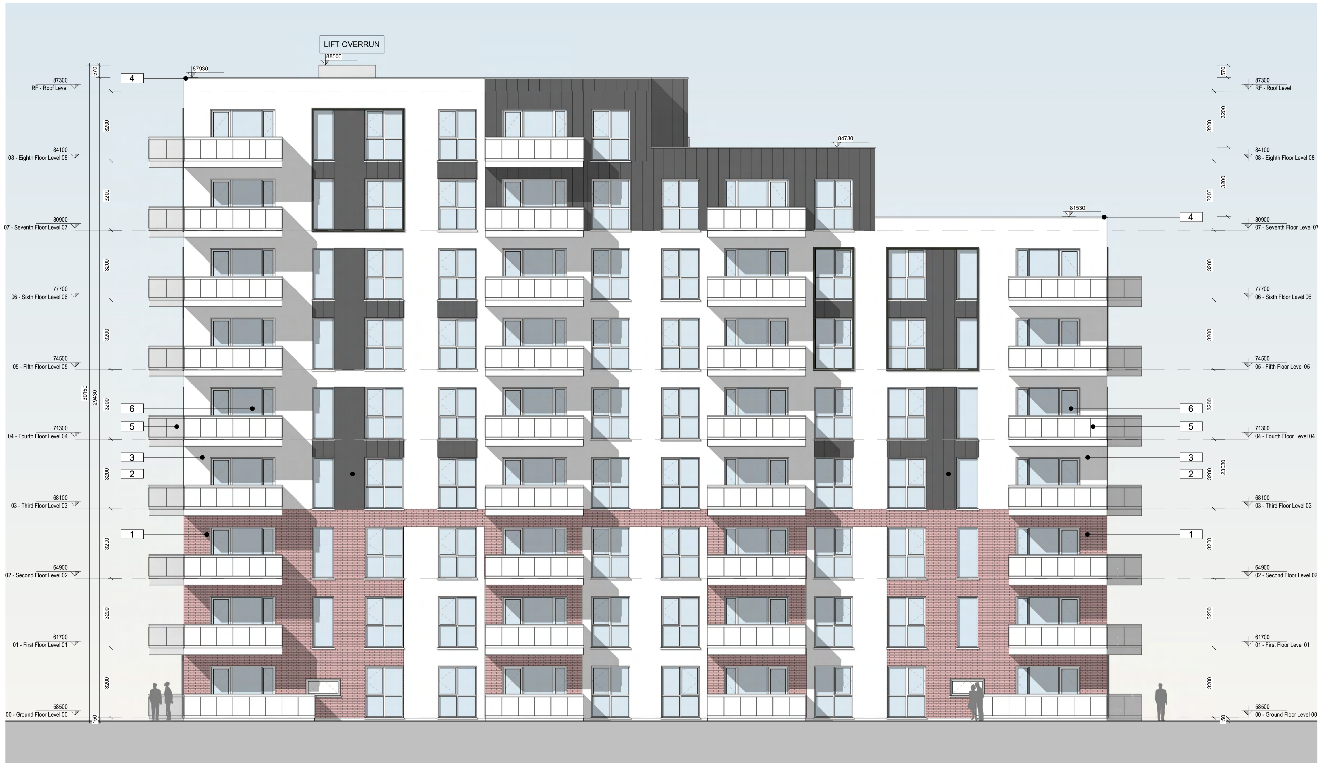
1 East Elevation 1 : 100

Please consider the environment before printing this sheet