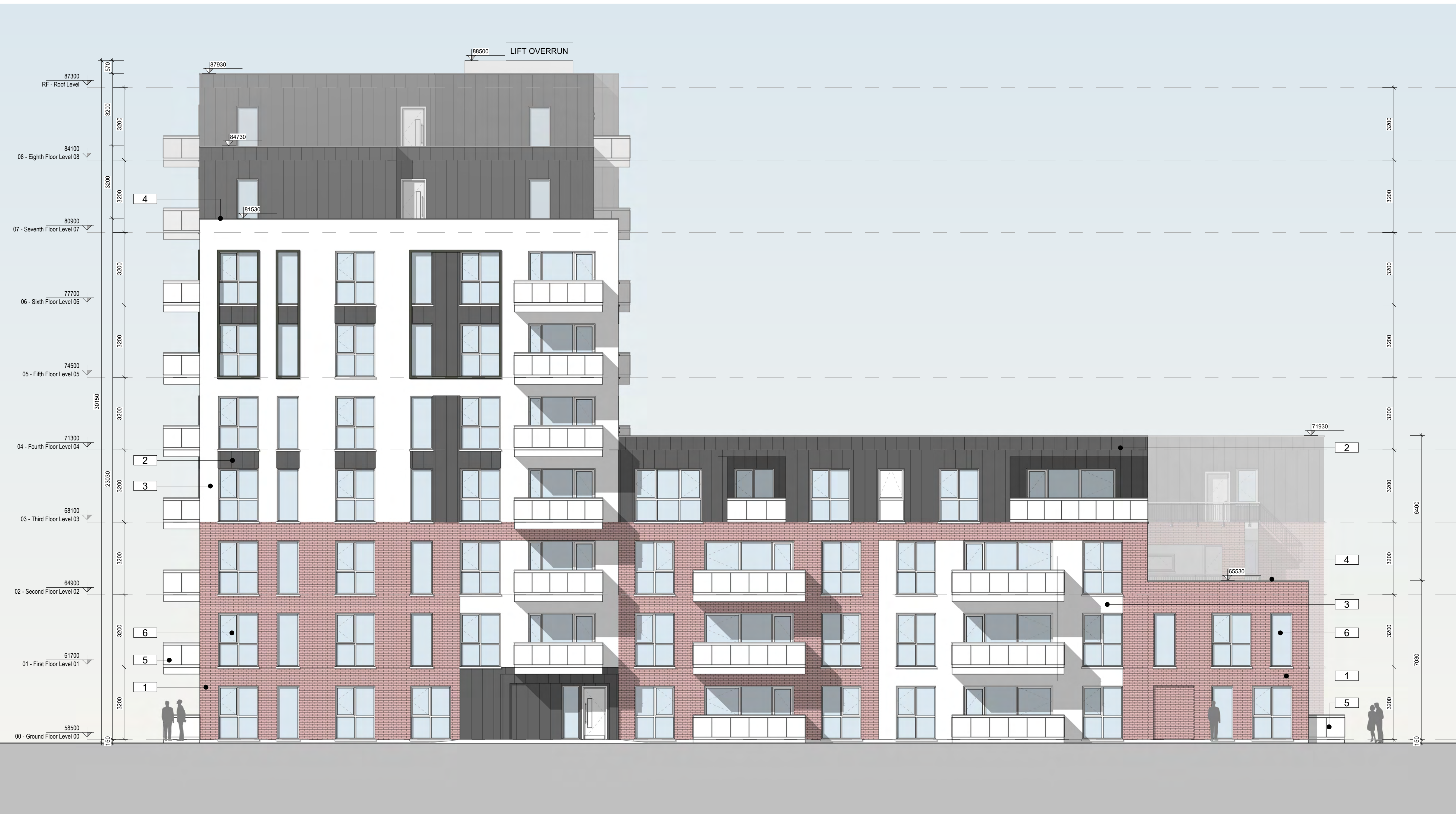
1 North Elevation 1 : 100

Please consider the environment before printing this sheet