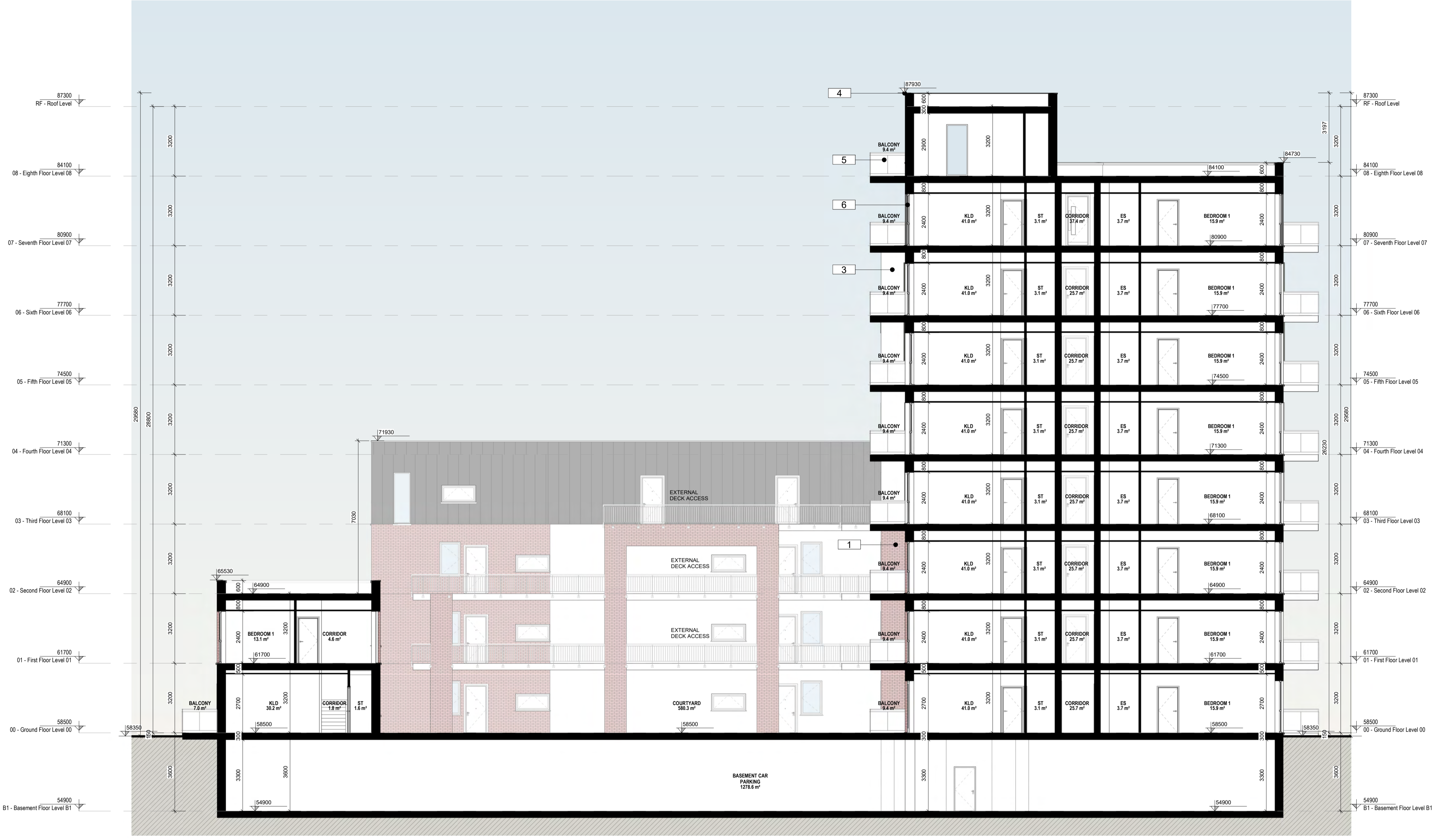
1 Section A-A 1 : 100

Please consider the environment before printing this sheet