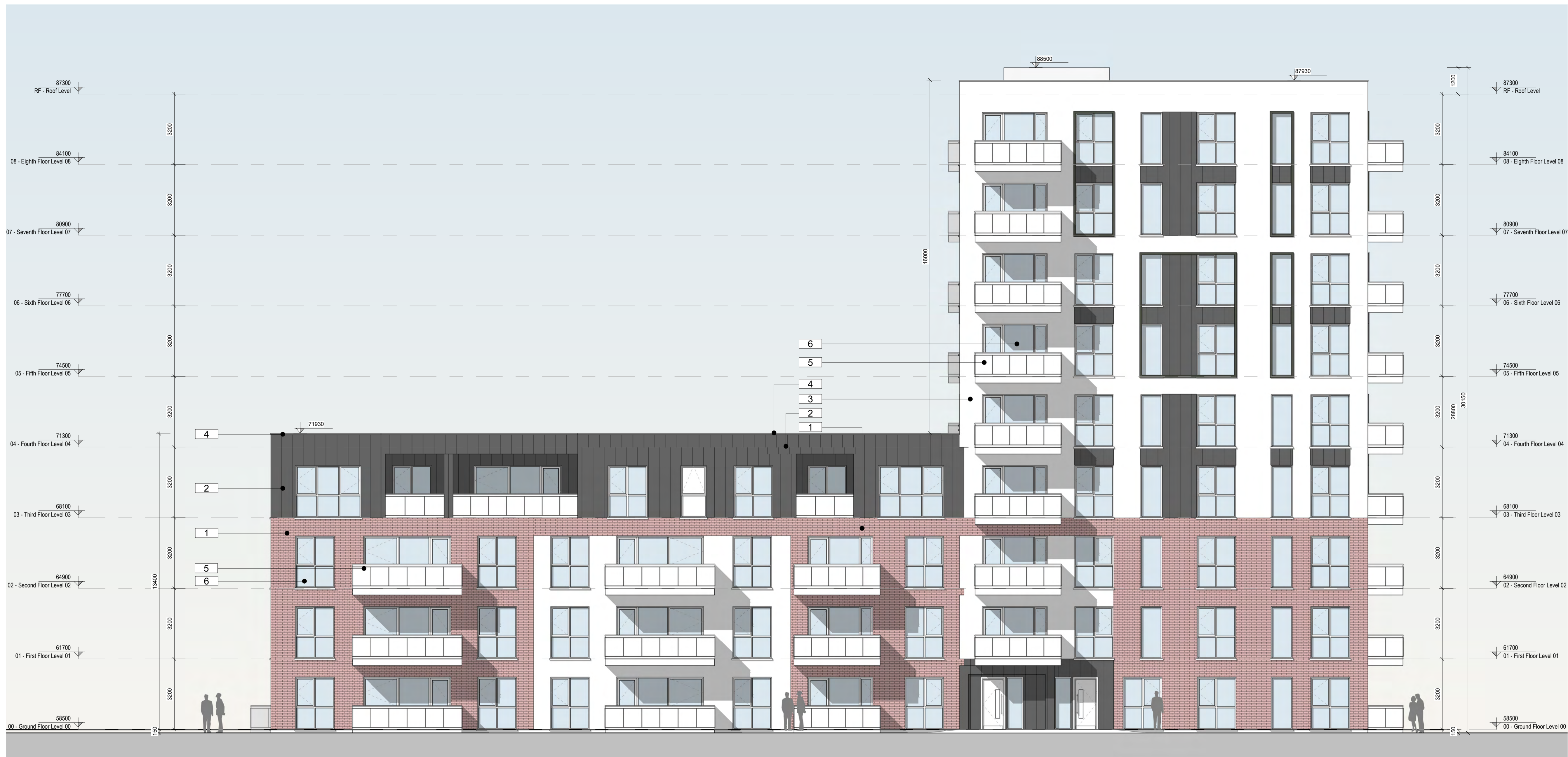
1 South Elevation 1 : 100

Please consider the environment before printing this sheet