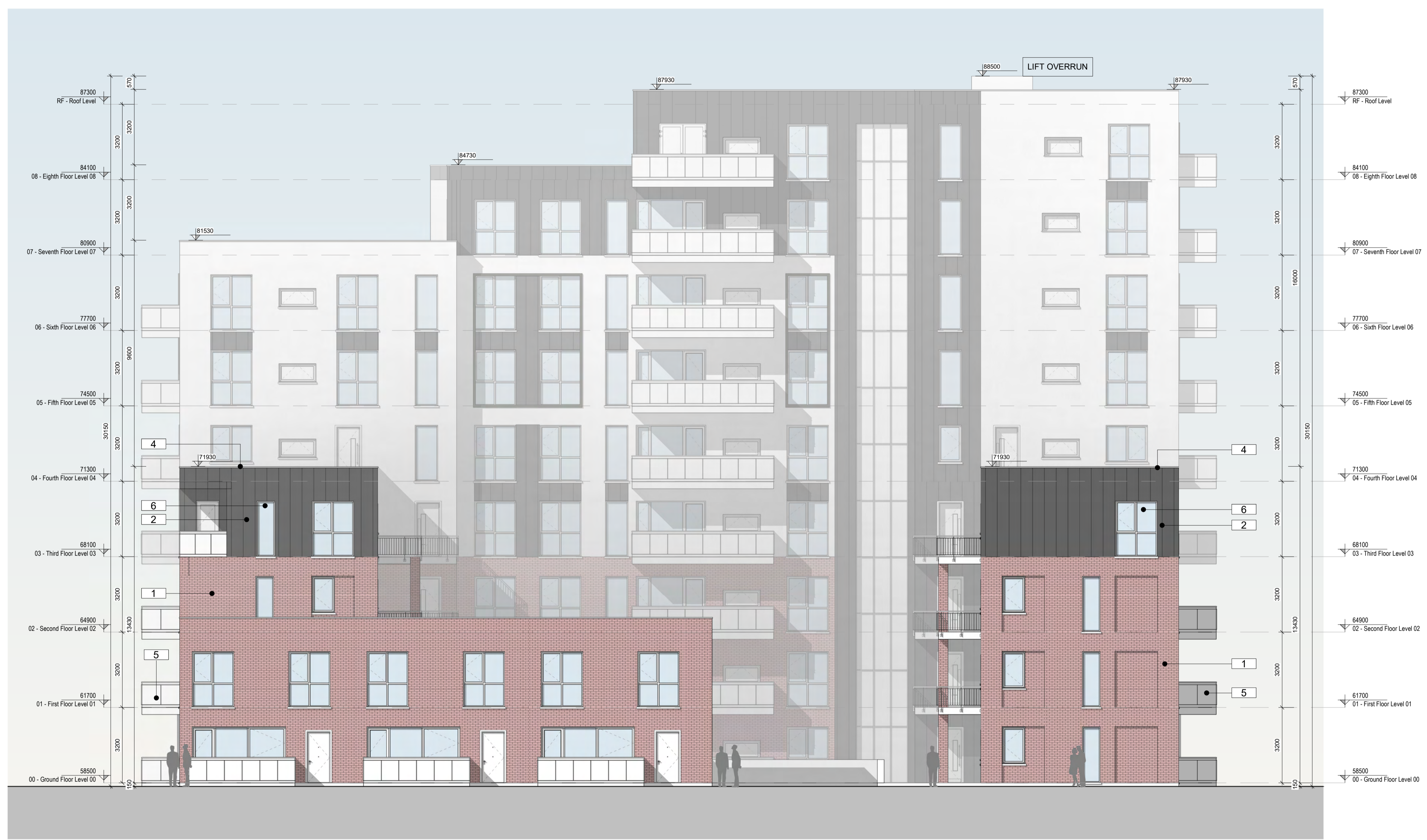
1 West Elevation 1 : 100

Please consider the environment before printing this sheet