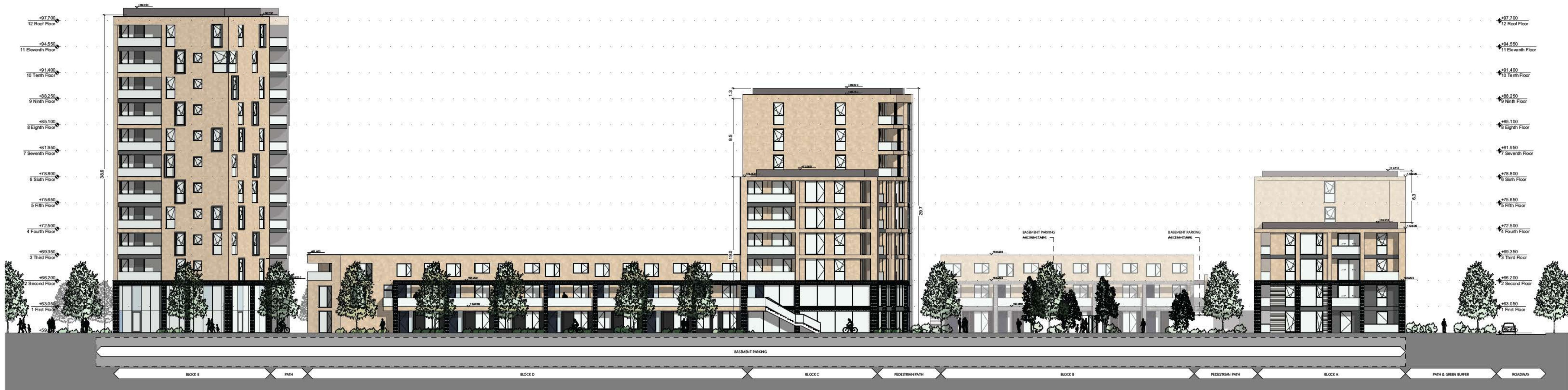
NORTH ELEVATION SCALE 1:200