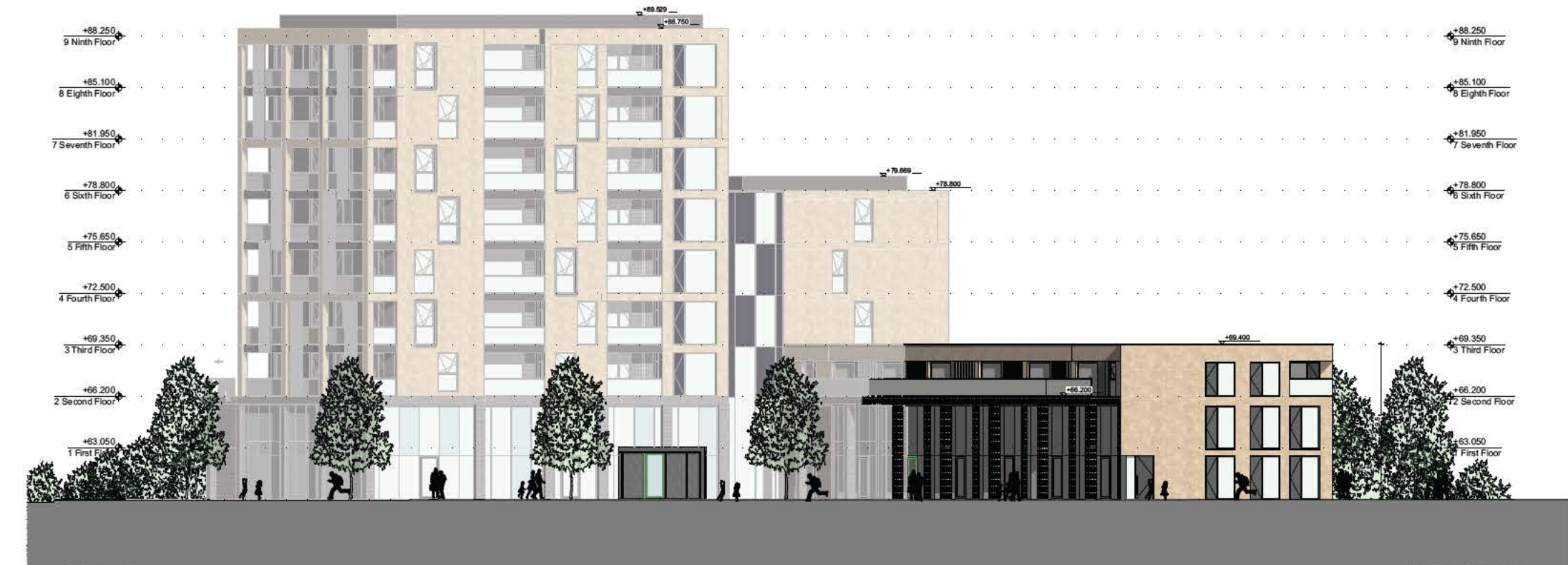
EAST ELEVATION SCALE 1:200