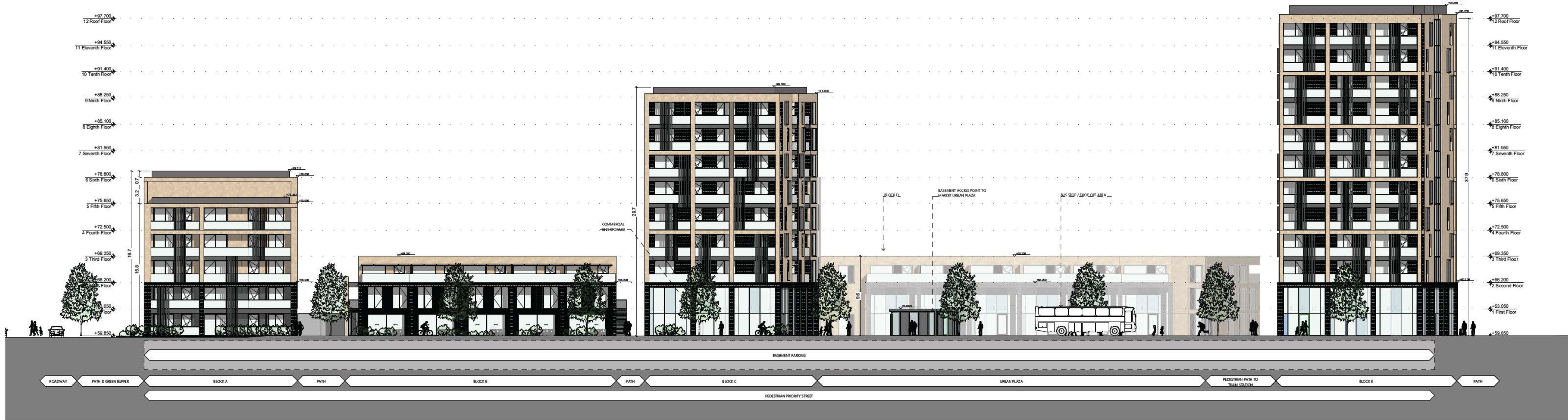
SOUTH ELEVATION SCALE 1:200